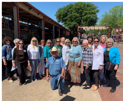
Fort Worth Stockyards Day Trip