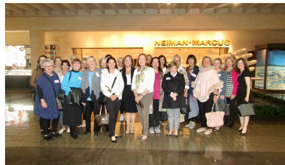
NorthPark Center Insider Tour