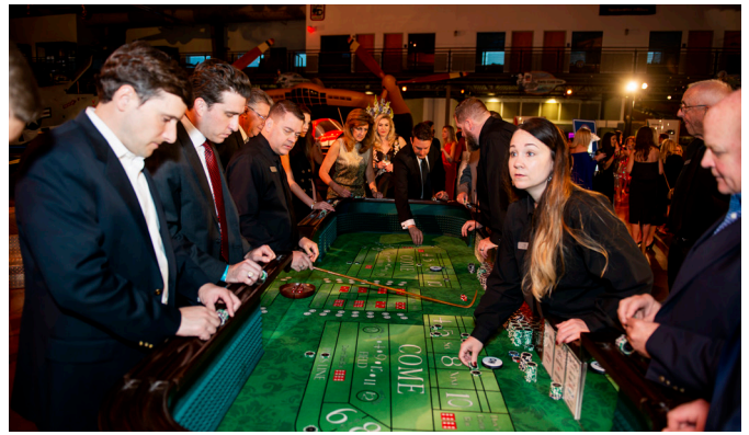
Above and Below: Guests enjoy one of the many gaming tables