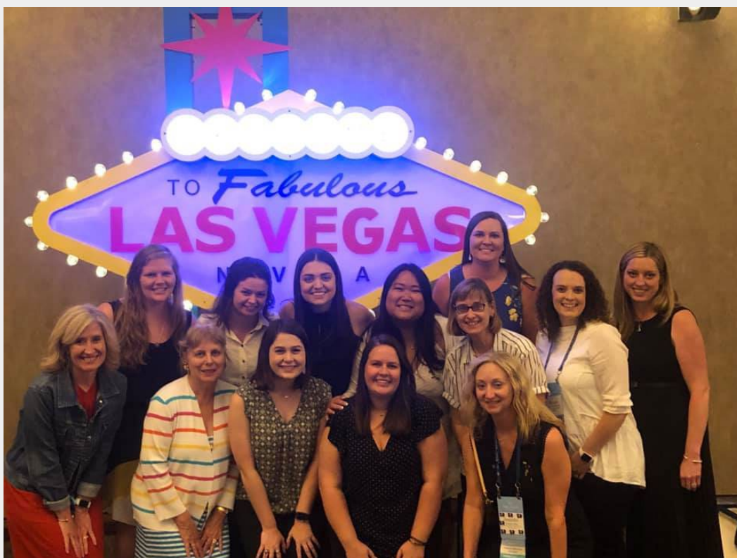
Thursday Night Dinner Gamma Chi collegiates and alumnae snap a picture in front of the famous Las Vegas sign before heading into the ballroom for dinner.