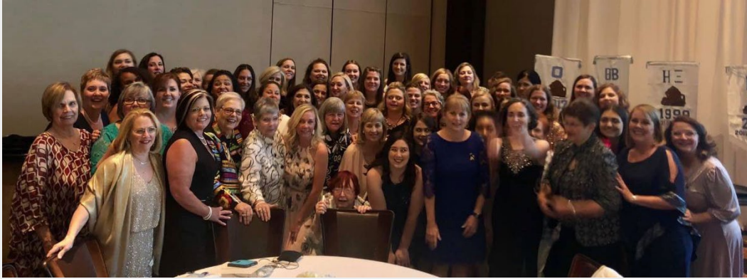
Saturday Night Awards Banquet Texas convention attendees (collegiate and alumnae) gather for a picture following the banquet and closure of the 168th Anniversary Alpha Delta Pi Convention. #BeTheFirst #ADPiConvention

In recognition of this achievement, a donation will be made in your honor to the Alpha Delta Pi Foundation's RMHC Endowment Fund. This fund allows us to expand our reach and support more Ronald McDonald Houses.