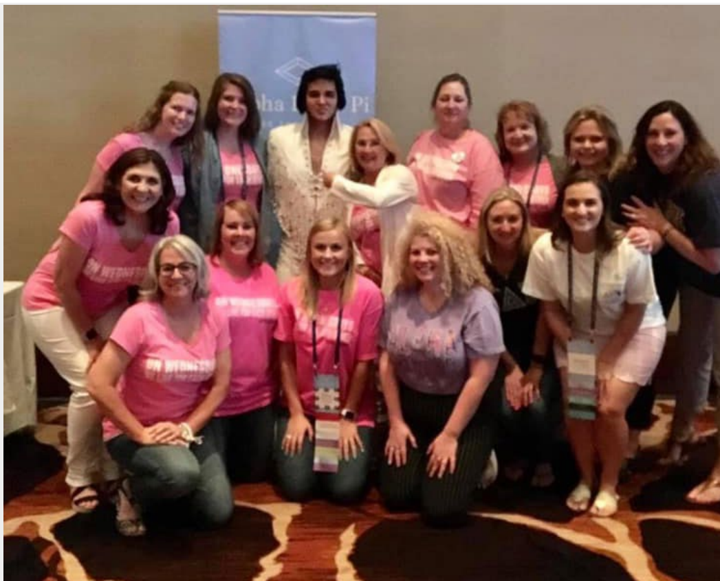
Wednesday Night Brand Reveal Texas State Alumnae Association members pose with a Las Vegas legend, Elvis Presley. #BeTheFirst #ADPiConvention